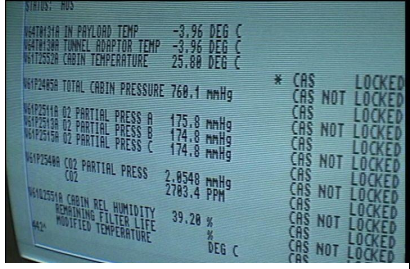
Amiga screen displays live user data from the orbiting space shuttle!

Gary went on to tell us that their first choice was the Macintosh, but as it was a closed system, Apple wouldn't give NASA enough information to get into it at the level that was needed. Talk about blowing a marketing opportunity!