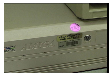
Amiga 4000 development system

the Amiga, we remote it to them on another Amiga which then pulls up data and sends it to their PC which controls an environmental chamber so that they can duplicate the environmental conditions on the shuttle down here except for gravity. So that's their control group. They can have a group of animals or insects on the shuttle in zero G and the same animals in the same environmental conditions with normal G about five hangers down the road from here. And the Amiga data is what they use to control their growth chamber to keep the environment the same."